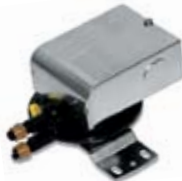
PowerAir™ Activator Model #1950105