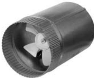
PowerAir™ Air Booster Model #1950101