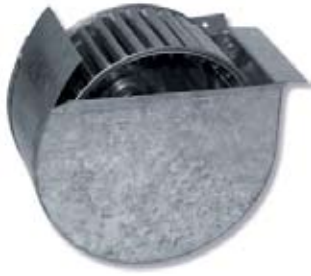
PowerAir™ Air Booster Model # 1950103