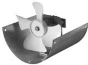
PowerAir™ Air Booster Model #1950104