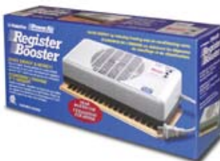
PowerAir™ Register Booster Model #1950106